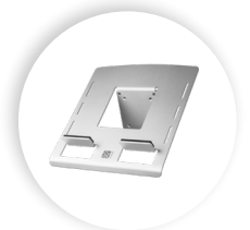
R-GO MORELIA LAPTOP HOLDER